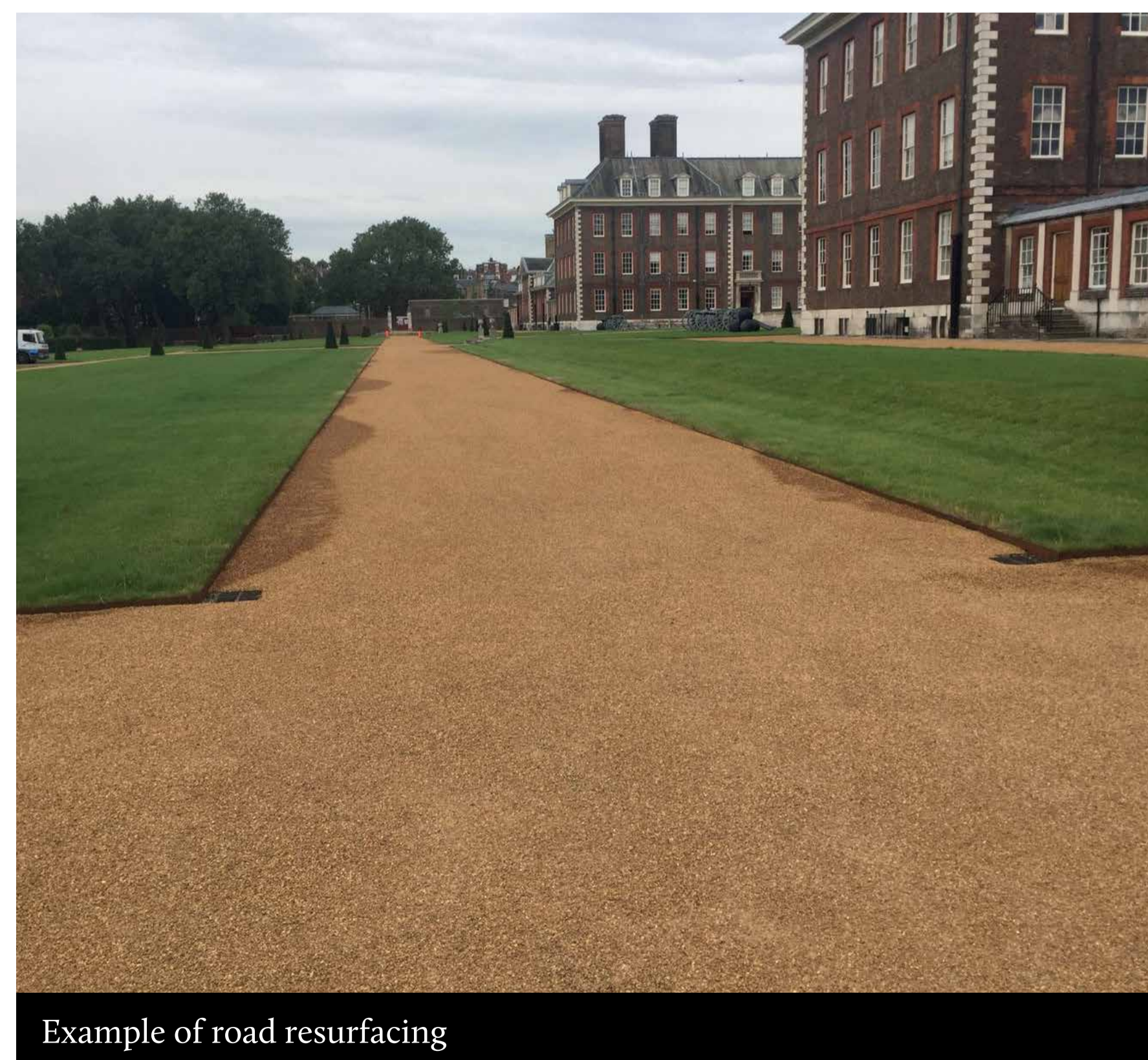
Example of road resurfacing