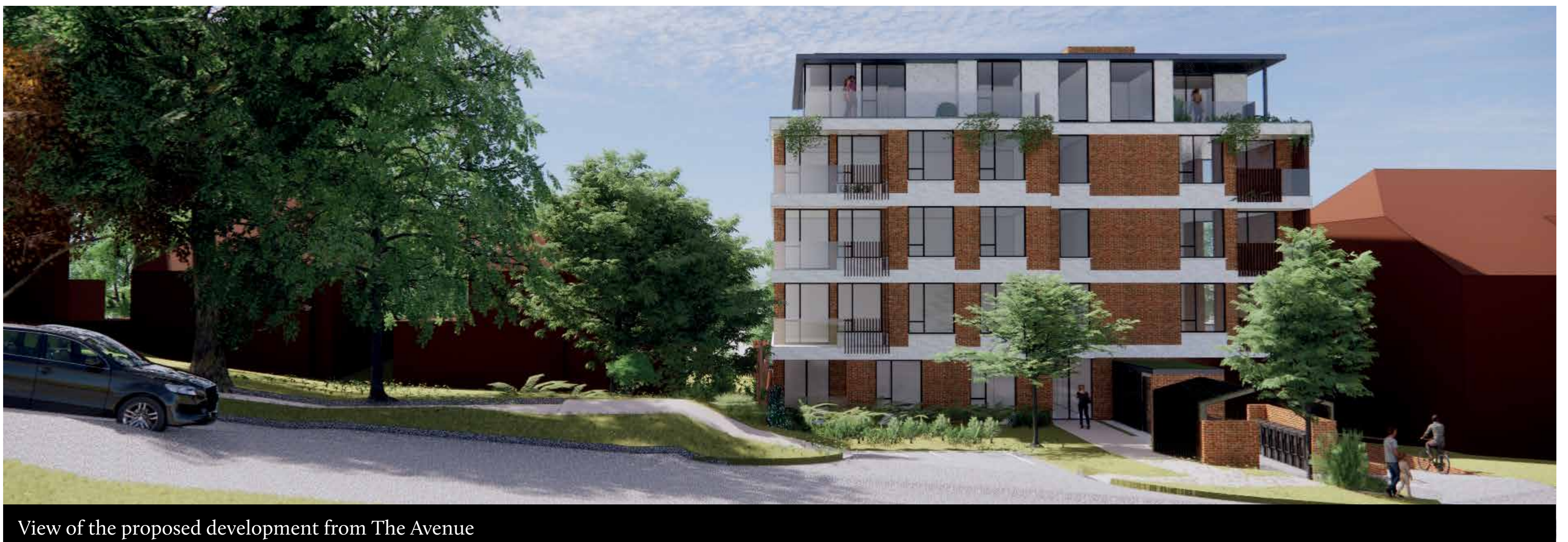
View of the proposed development from The Avenue